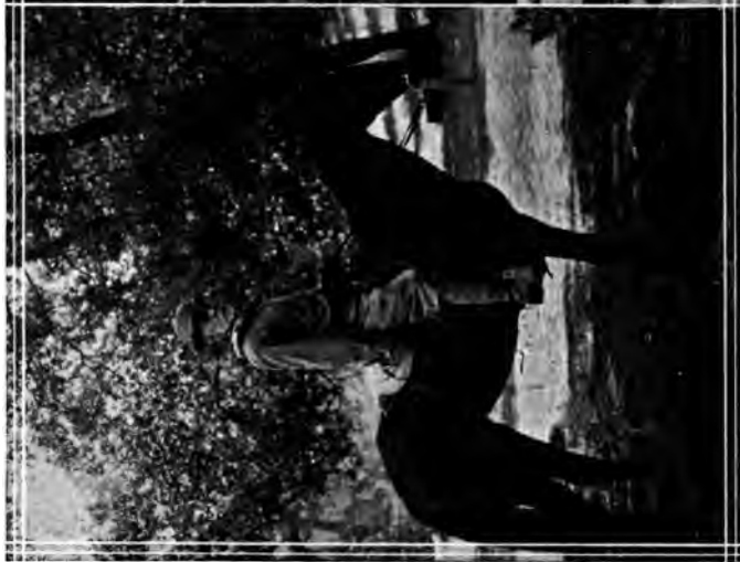
IN THE SIERRAS, 1910